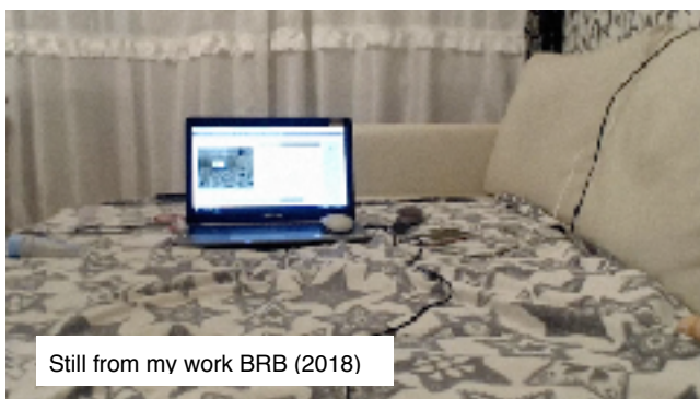
Still from my work BRB (2018)

My background is in filmmaking. In my practice as a filmmaker I always tried to create films that reflect upon a certain subject without it becoming pamphletistic. As a person you form your own ideas and opinions, and as a filmmaker I want to give people the possibility to view things from a different (or closer) perspective. This room for the viewer to reflect upon is very important to me. At the same time I don't want my work to be vague. I hope that when people see my work it's clear to them what questions resonate through the work.